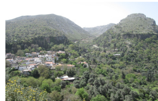
A Cretan landscape.