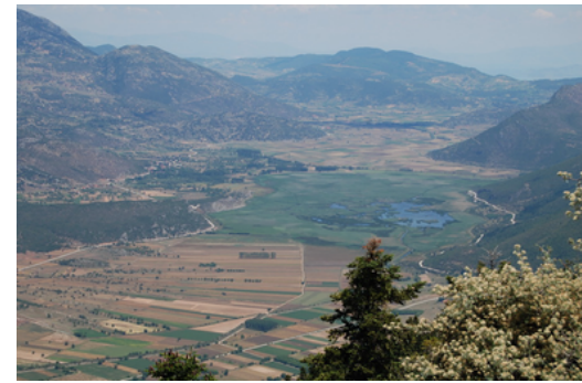
The lake valley of Stymphalos.