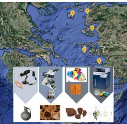
The geographical focus and methodological approach of the project, courtesy of Sergios Menelaou,