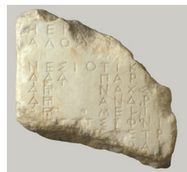
Fragment of an inscribed tribute list, 425/4 BCE, source: Metropolitan Museum of Art, Fletcher Fund, 1926.