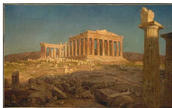
Frederic Edwin Church, The Parthenon (1871).