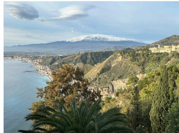
A view of Mt. Etna